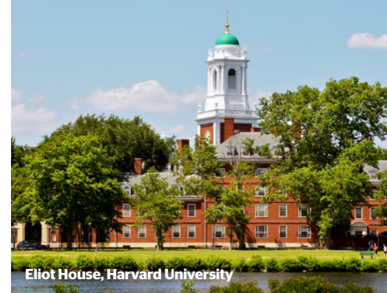
Eliot House, Harvard University

its 50 states with selling points including impressive facilities, a vibrant campus life and the chance to become a well-rounded graduate with great breadth of knowledge.