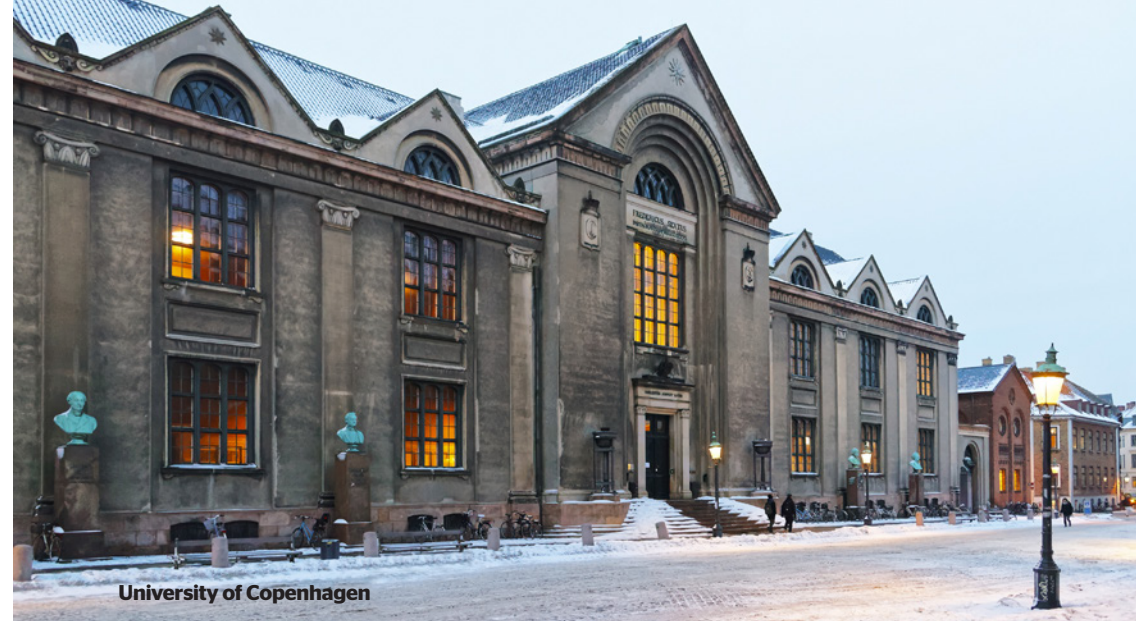
University of Copenhagen

Moving thousands of miles and starting a new educational pathway isn't a decision to be taken lightly, so how will you know if this is the right option for you?